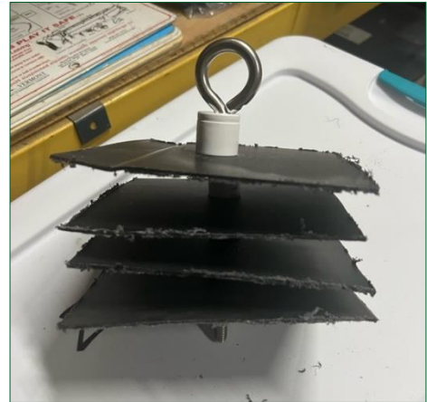
Figure 1. Vermont design sampler constructed with plastic trash can pieces.