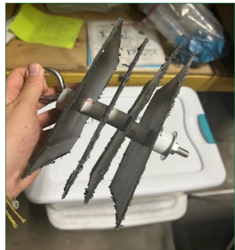
Figure 2. Vermont design sampler constructed with plastic trash can pieces, angled view.